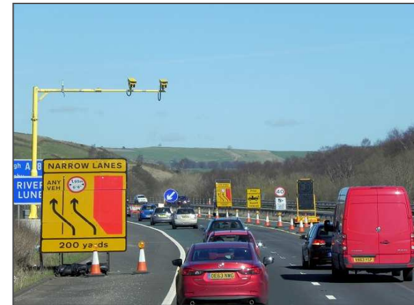
Indicative traffic management