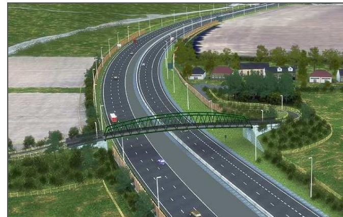
Proposed three-lane road layout.