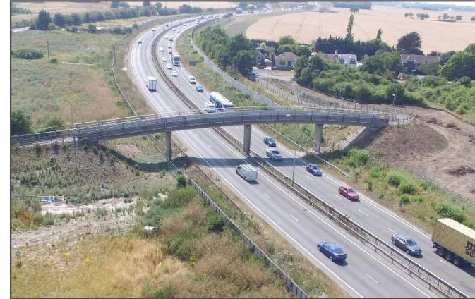
Current two-lane road layout.